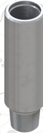
STANDARD SAVER SUBS