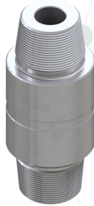
TOP DRIVE SAVER SUBS