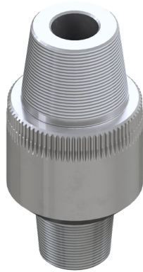
SPLINED TOP DRIVE SAVER SUBS